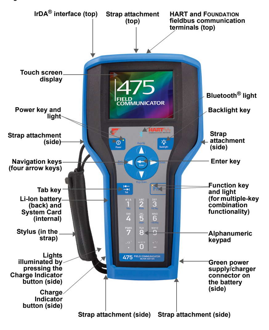
Figure 1. 475 Field Communicator with the Protective Rubber Boot